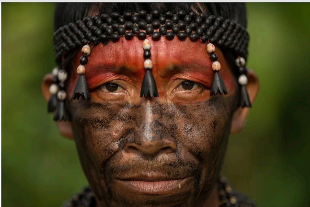
For those who are to come

With an ever-watchful eye on the people of the forest – people who write the history of the region every day – their photographs help us to reflect on the importance of keeping this ecosystem alive and finding solutions to minimise the impact of exploitation.