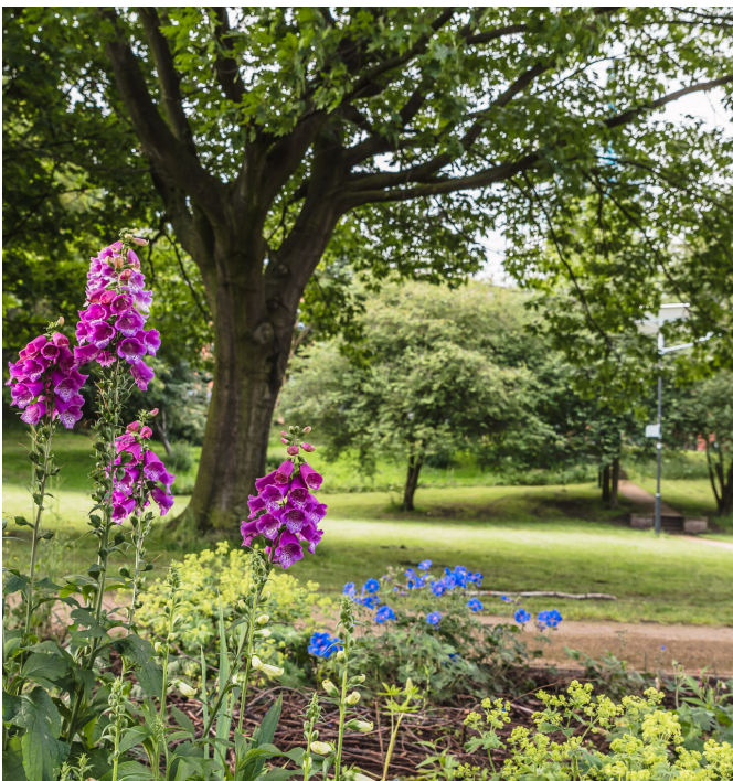
Angel Meadow Park

Finally, look out for the Climate Change Myth Buster (pictured) – an interactive performance installation from arts organisation Walk the Plank , which engages people in conversations around climate change – debunking some myths along the way!