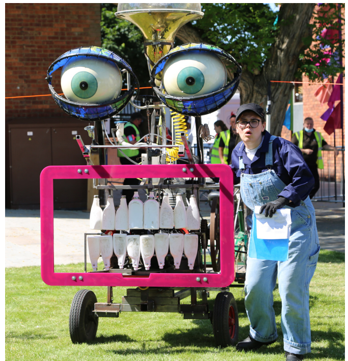
Walk the Plank's Carbon Buster