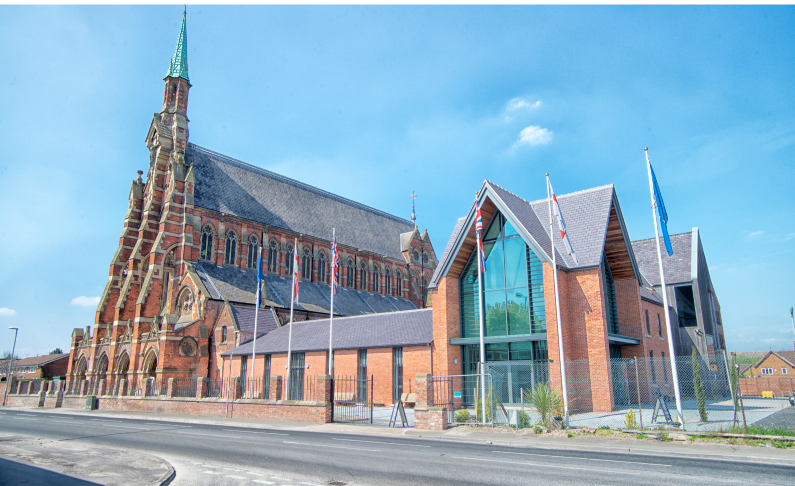
The Manchester Monastery, Gorton

The Nationwide Cycling Academy will be offering free servicing for bicycles. There will also be a clothes swap, as well as performances from the Gorton Voice Choir and Youth Zone Voices Group with Manchester Camerata .